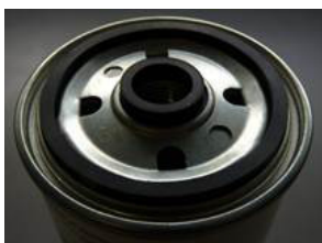
P550588 - Old version

The old version of P550588 has an external seal at the thread, at the top of the filter. This seal is replaced on the new version by an internal thread seal on the grommet which is positioned inside the filter.