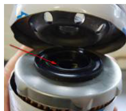
P550588 - New version